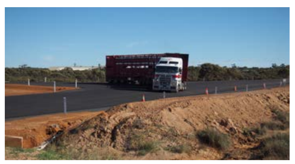
Intersection Jilakin Street / Kulin - Lake Grace Road