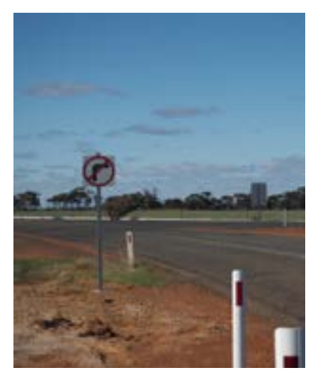
Kulin - Lake Grace Road