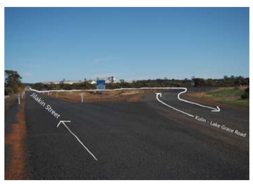
Intersection Jilakin Street / Kulin - Lake Grace Road