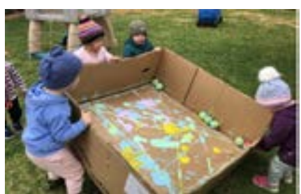
together as a team to roll the tennis balls around to spread the paint.

This week we also picked buckets of blood red oranges from our own fruit tree. We then got some soapy water and gave them a good wash before we squeezed them to make some lovely fresh juice.