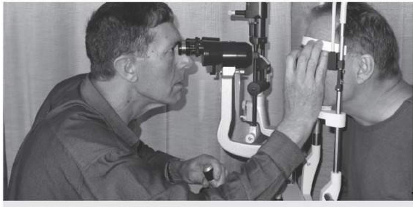
Eye exams will be conducted

Kondinin Medical Centre 26 February 2018