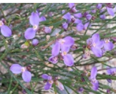
broom milkwort 50cm Comesperma scoparium

Domes or splayed, sharp leaves Hibbertia acerosa