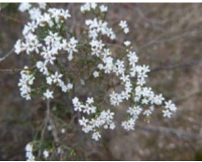
frilly white beards, 50cm Leucopogon fimbriatus