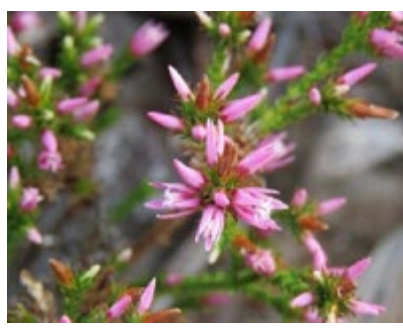
pink domes 30x15cm Andersonia caerulea

THE BEES KNEES – if you have a bushland patch to supply you with honey all year round add these little delights to encourage the bees to stay through the autumn-winter . They are hard to see just driving by but take a wander and you will find them hiding in the scrub. These tend to flower with rain in summer and autumn but do mass displays in spring as well. They grow in well drained combinations of sand, clay, loam and gravel. The seeds are hard to find and are difficult to germinate so drop by for hints on striking cuttings which flower in the first year. Closest sites are on the Macrocarpa Trail 1km NW or at the Kulin Road Nature Reserve 10km NW – park in a gravel pit and take a wander.