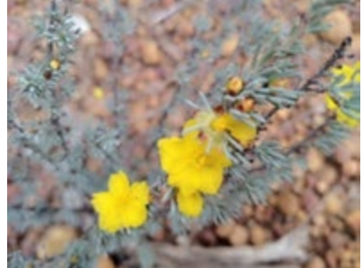
Erect grey leaved stems Hibbertia rupicola

ORCHID DRAWCARDS Albany visitors found the Winter Spider Orchid , Caladenia drummondii , at Gnarming West/ Kulin-Corrigin crossroad, and after many miles I found 4 in dense scrub by the road. If you see cars by the roadsides, stop and see what the Orchid Hunters are looking for. Call if you wish to join us on a flowers and orchids walk between the next rain patches in June.