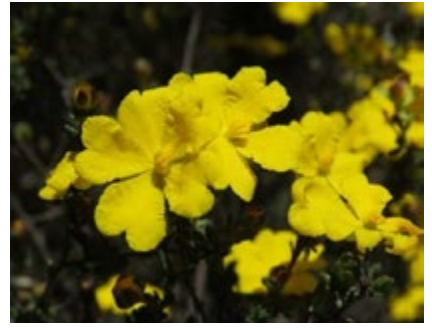
50cm dense shrub, dark green Hibbertia gracilipes