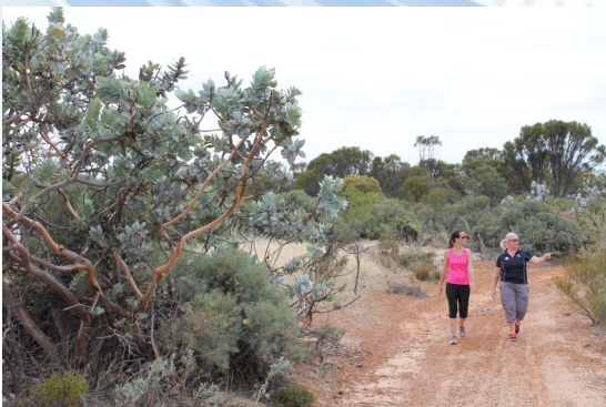
Council owned wildflower reserve, Macrocarpa Trail