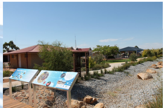
Stormwater Reuse drainage through the CBD