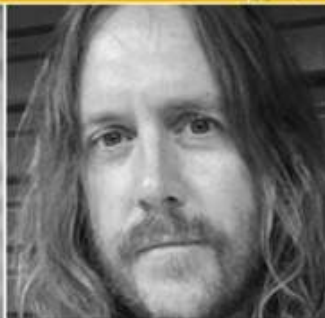
KRAM FROM 'SPIDERBAIT'