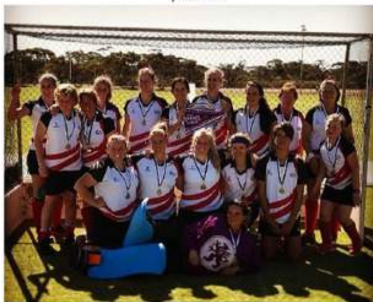
KK Vipers B Grade back to back to back premiers.

A Grade played a great game of hockey putting the first goal of the game on the board. Souths matched it and with a lift in intensity in the second half put two more goals on the board. Unfortunately our A Grade girls could not match this and lost 3-1.