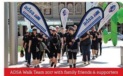
ADSA Walk Team 2017 with family friends & supporters