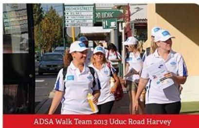
ADSA Walk Team 2013 Uduc Road Harvey