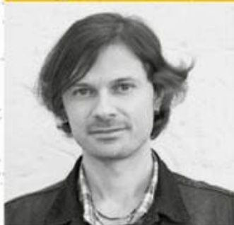
DARREN MIDDLETON FROM 'POWDERFINGER'