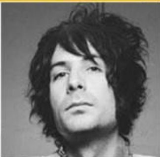
DAVEY LANE FROM 'YOU AM I'