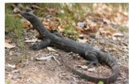
Heath monitor.

Refer to www.naturemap.dpaw.wa.gov.au to find further information on these species' distributions.