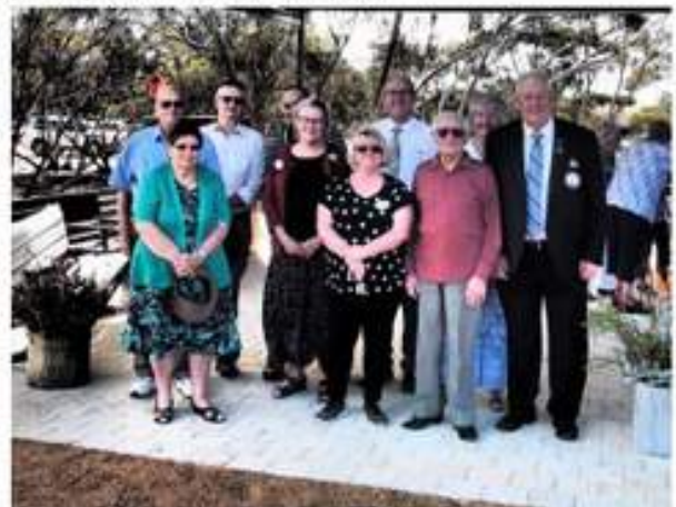
Kulin Lions Club Members