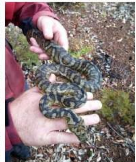
Carpet python.