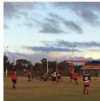
Our men getting a brief break in the rain and wind during their game.