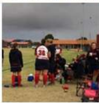
Despite the wet weather the Vipers were out supporting each other all day.