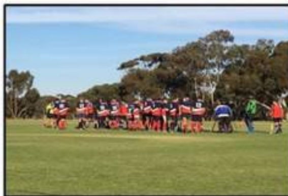
Our men's team lined up ready for their game v LG/Kuk