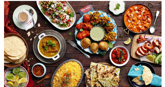
Generic Indian food images