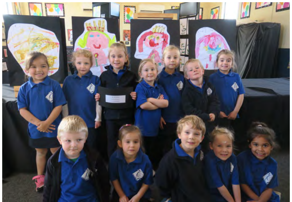
Students at the KDHS art exhibition standing proudly in front of their masterpieces - 'QU' sound for queens.