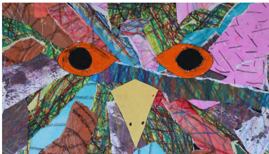
Cadel Bowey, 'Expressions of an animal'