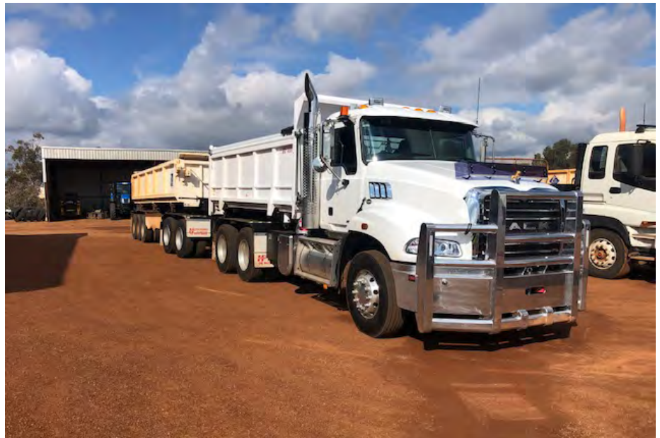
The Council's latest piece of equipment: a new Mack 6 wheeler side and end tipper capable of towing a 5 axle dog trailer.

The Kulin Community Hub is also enjoying the latest restrictions of COVID being lifted. I've personally enjoyed a couple of samples of their new menu. They've even found some fame on ABC TV a couple of