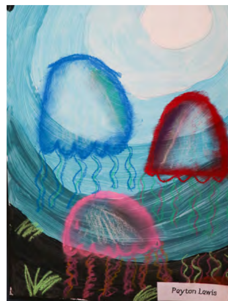
Peyton Lewis, 'Under the sea'