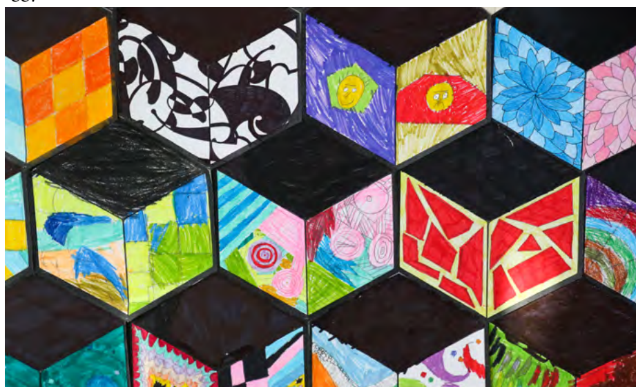
'Collaborative Cube Art', Year 2 to 8