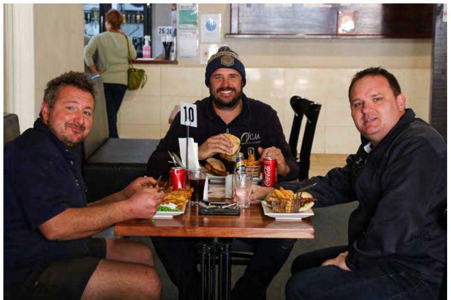
The Kulin Community Hub is also enjoying the latest restrictions of COVID being lifted.

Sundays ago. The FRC is also back up and running, as an alternative watering hole over the weekend and for designated community events.