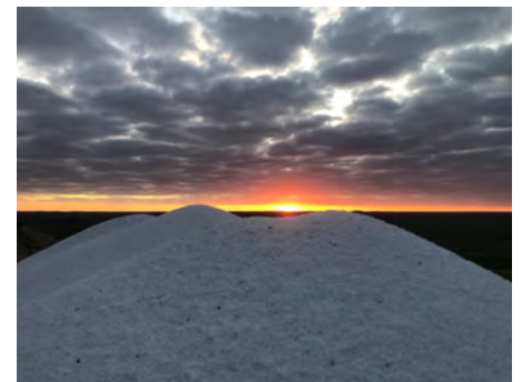
‘The sun rising over the snowy lime pile’ by Rob Doust