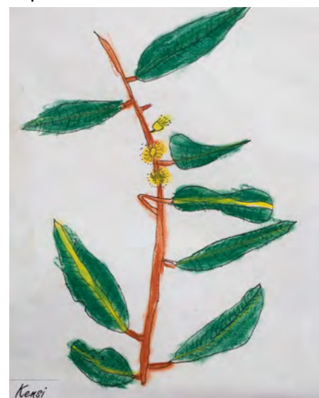
Kensi, 'Eucalyptus Sketch'