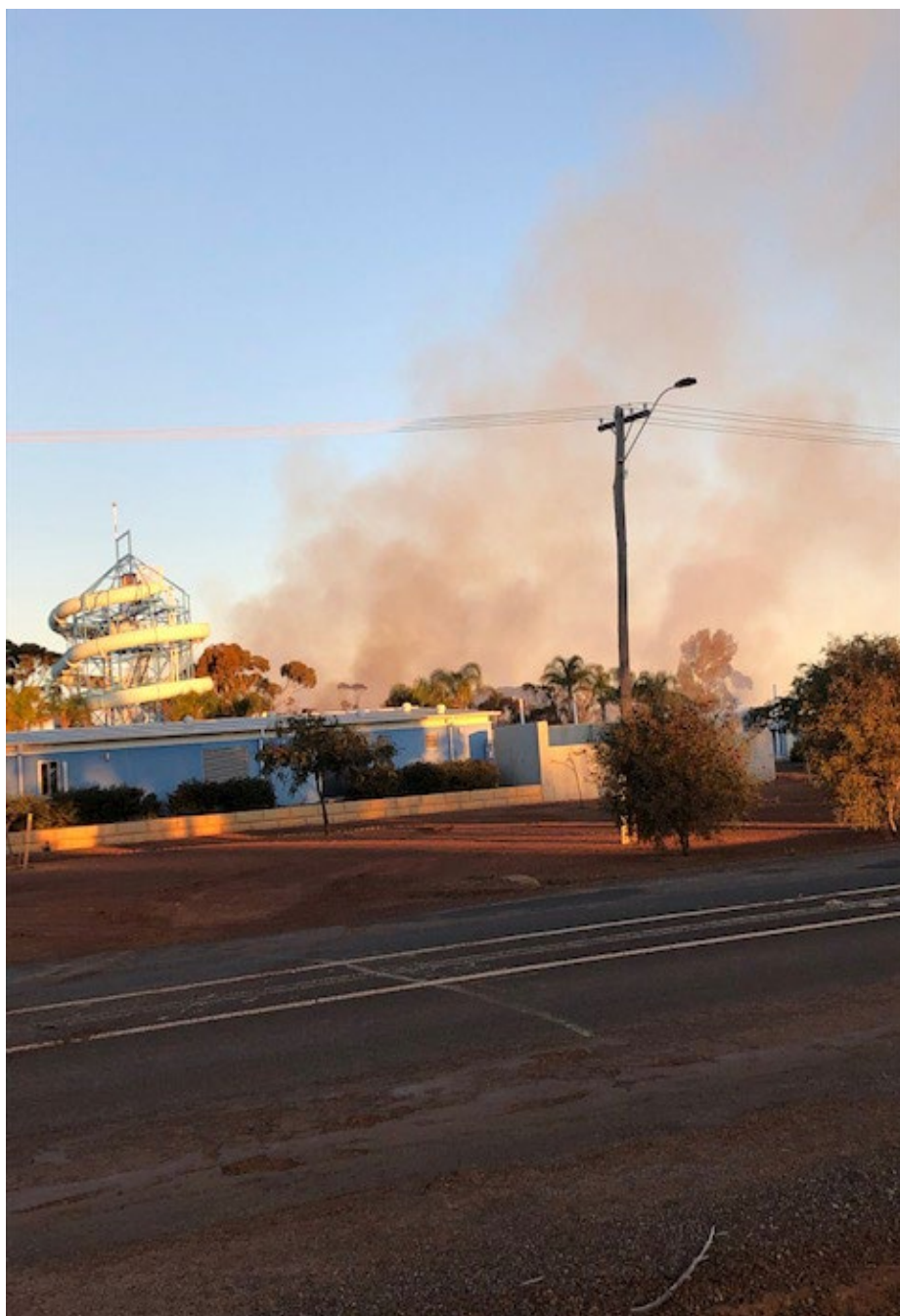
The controlled burn is behind the Aquatic Centre

A special shout out to the students and staff at KDHS, as well as the Cultivating Kulin group. Whilst I mention Cultivating Kulin, it was great