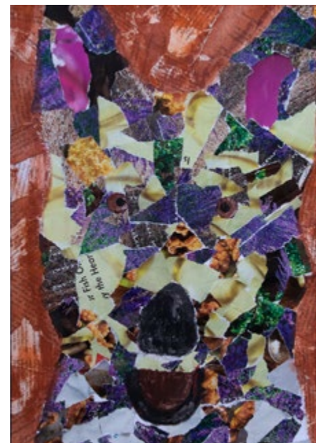
Isobel Noble Dog Year 7 & 8