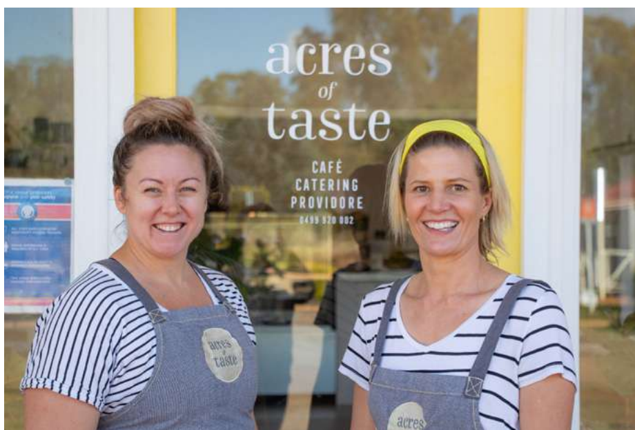
Acres of Taste are back to producing delightful goodies.

As was publicised in my previous CEO Corner, Shire staff and Council successfully held Community Workshops to engage with the wider community and specific groups regarding potential community infrastructure projects to capitalise on the current funding opportunities outlined by both the Federal and State Governments.