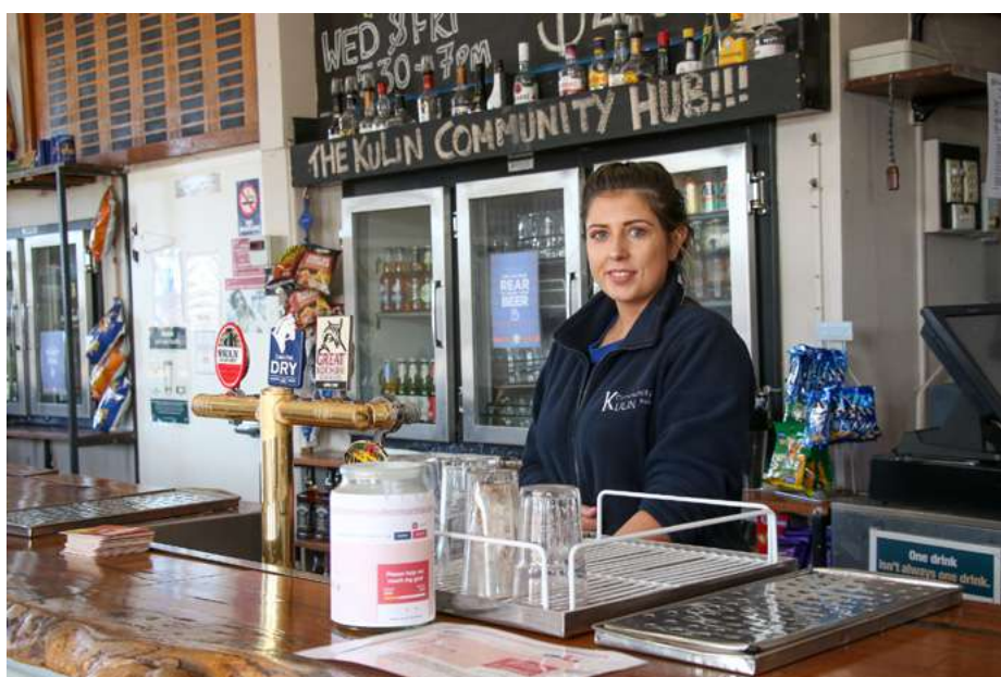
The Kulin Community Hub are starting to welcome visitors, from near and far, through their doors again.

It was great to witness the enthusiasm of the KDHS students with contribution towards the 'All Ages Activity Precinct'. Last year a group of students wrote to Council with their ideas regarding potential 'youth' focused infrastructure. The students have since been working with Shire staff to