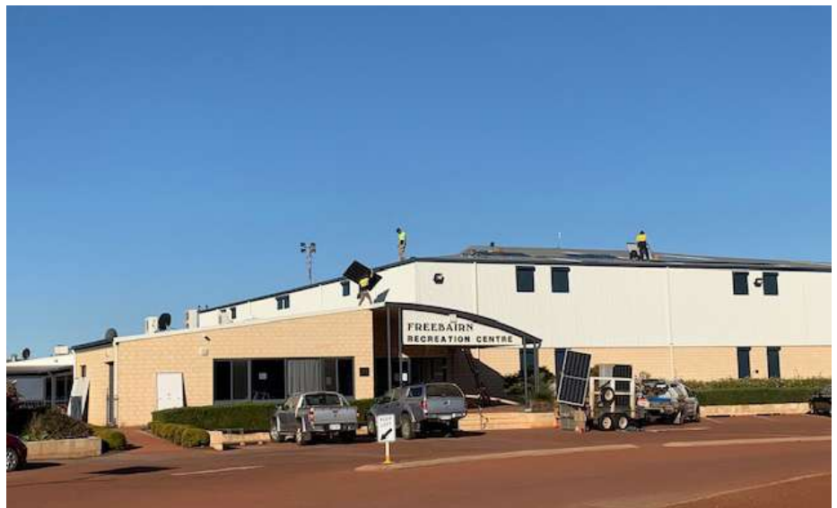
Solar panels have been installed.