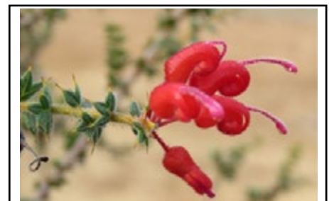
Red Star Grevillea – 2x2m shrub Grevillea asteriscosa