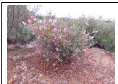
pink myrtle – small shrub Hypocalymma puniceum