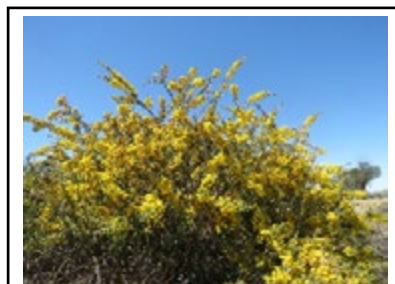
spiky wattle - 1m shrub Acacia acutata