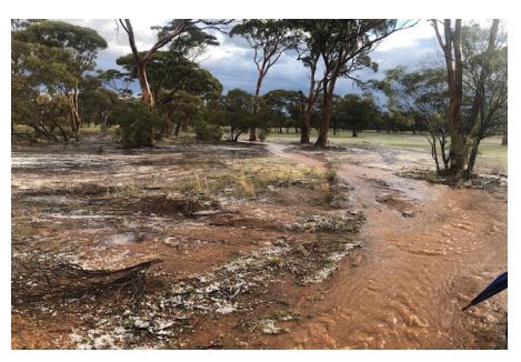
Kulin Golf Course