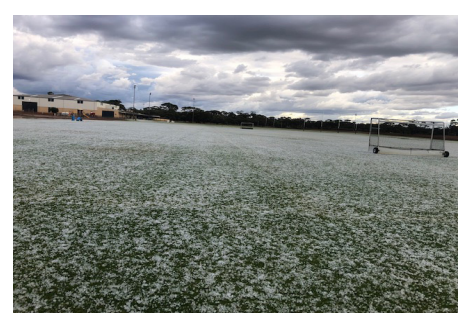
Freebain Recreation Centre Oval