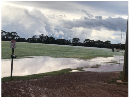
Freebairn Recreation Centre Oval