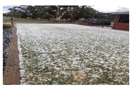
Kulin Golf Course