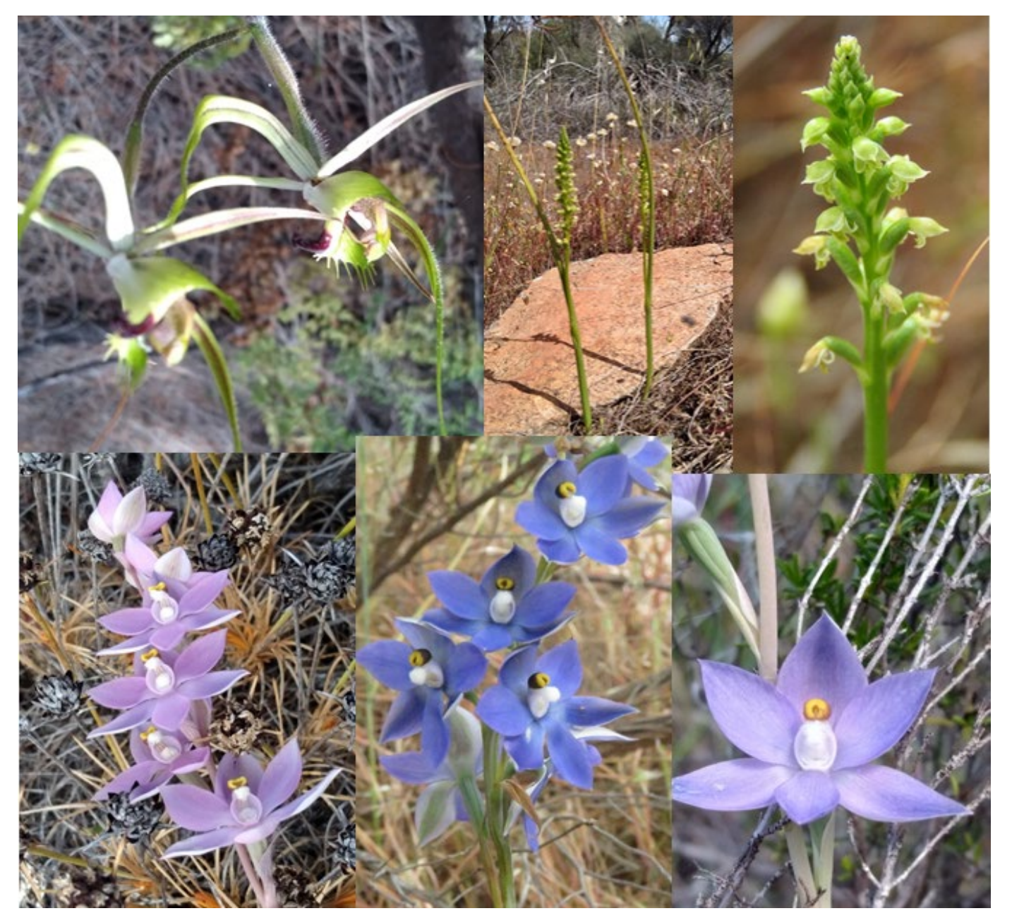
GREEN-FRINGED MANTIS ORCHIDS AND MIGNONETTES WITH SCENTED AND GRANITE BLUE SUNS

Dedicated orchid seekers and the Tesla Owners WA were delighted by these orchids last week and enjoyed the climb and views of the lake and farmlands. We took the gentle slope on the eastern side.